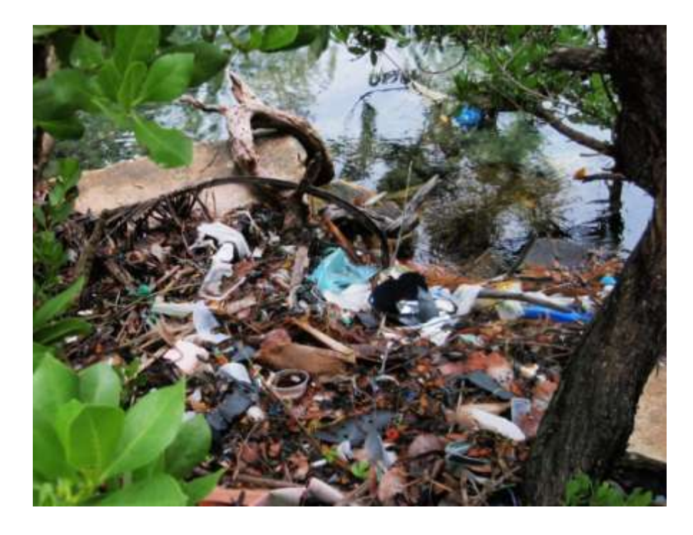
Debris including plastic bags at Shark Hole.

the resources agency, state of California (2005)). Tourism is a vital part of the Bermuda Economy so plastic bags ending up as trash on our beaches will have a negative impact on our tourism product. Conversely, if Bermuda passes a law to reduce resource use and the harmful effects of plastic bags, this will raise Bermuda's profile as an 'eco-friendly' destination.