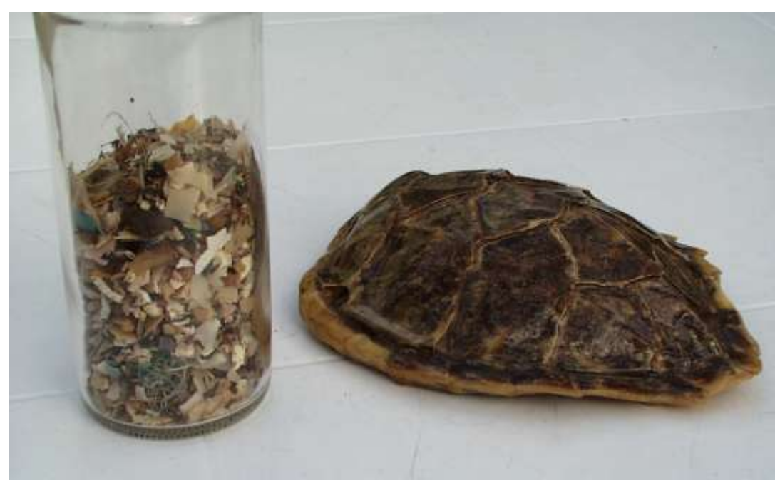
Bermuda hawksbill turtle found with 2,825 plastic fragments in its gut.

Impact on human and ocean health: Plastic bags remain toxic even after they break down — polyethylene in the ocean goes through a process called photo-degradation resulting in tiny particles of plastic. These particles selectively absorb persistent organic pollutants (such as PCBs and DDT) available at low concentrations in the ocean (5gyres.org/see_global_research). Plastic marine debris affects at least 267 species worldwide, including 86 percent of all sea turtle species, 44 percent of all sea bird species, and 43 percent of marine mammal species (Coe, J. M. and D. B. Rogers (Eds.), Marine Debris - Sources, Impacts and Solutions. Springer-Verlag, New York, pp. 99-139, also 'Marine Debris' in Beachapedia). As humans are at the top of most of these food chains, plastic could pose a danger to human health. In Bermuda, plastic bags have also been found in the digestive tracts or entangling local turtles (Bermuda Turtle Project, J. Gray). In addition, other pollutants may be added to plastics at the time of manufacturing and may ultimately leach into the environment. Two of the most common plastic additives are phthalates and bisphenol A (BPA), which are linked to endocrine disruption in wildlife and humans (Plastic Debris in the California Marine Ecosystem).