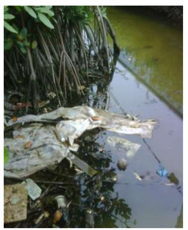
Bags and other debris in the Pembroke Canal. Ibid

According to the Department of Statistics from January to December 2012 Bermuda imported thin film plastic and paper bags to the value of $995,505 (Customs tariff numbers: 3923.210: sacks and bags of plastic polymers, 4819.400: sacks and bags of paper (less than 40cm)) (Source, private communication <u>ibbean@gov.bm</u>). Retailers would then have spent an additional $221,500 on duty to import these bags, resulting in a total cost to retailers of more than $1,200,000, a cost that is passed directly on to Bermuda residents.