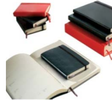
Molskine - Memo Journal FSC wood