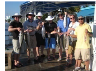
Broker fishing event- all fish was prepared for dinner that evening at Avalon.