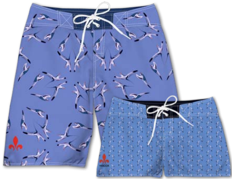
Custom Boardshorts- Shortomatic.com- Longtail photo