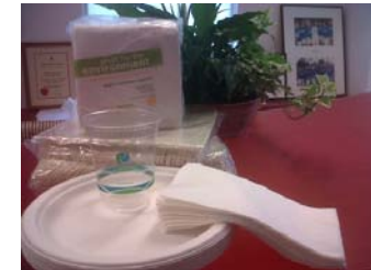
Events- Hiscox purchase a bulk order of biodegradable utensils/cups/plates and napkins. If porcelain is not used – we use these items for all offsite corporate/charity events.