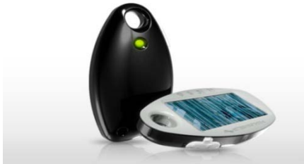
Mono Multi Device Charger Works with 3200+ devices Holds a charge up to one year