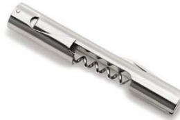
Blomus Wine Opener Stainless steel- no plastic