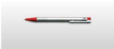
Lamy- pens with refillable cartridge.