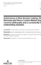
All Hx brochures are printed on FSC paper.