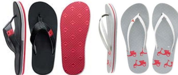
Freewaters- Men & Ladies Flipflops www.freewaters.com – each pair purchased donates water to 1 person for 1 year.